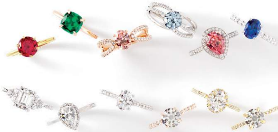
Above, left to right from top: 123713 | 123823 | 123748 | 123746 | 123615 | 123648 Second row, left to right: 123457 | 123449 | 123230 | 123229 | 123227 | 123450

Radiant Hues by ever&ever ® features best-selling bridal gemstone centers, and Ribbon of Light by ever&ever ® highlights the shimmering appeal of French-set bridal designs.