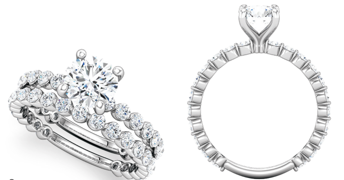
C. 123142 Round-Shape Diamond-Accented Semi-Set Engagement Ring, 1 CT center (6.5mm), 5/8 CTW, 14K White, 32, size 7, $1,695 . Mounting 123142, $355 . 123013 Matching Diamond Band, 3/4 CTW, 14K White, 32, size 7, $1,709 . Mounting 123013, $295 .