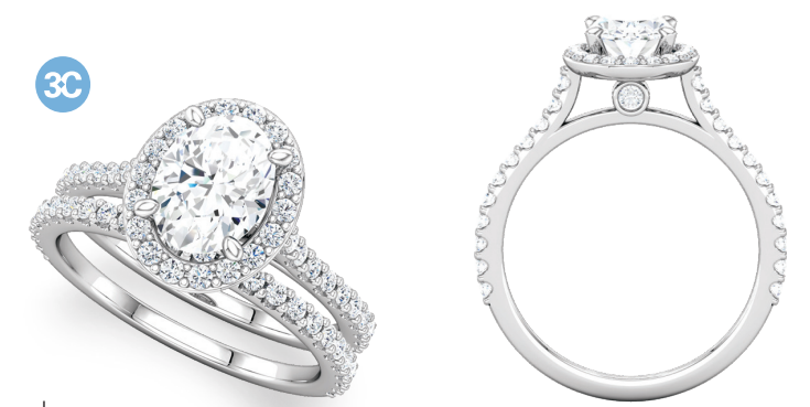
J. Available center stone shapes: