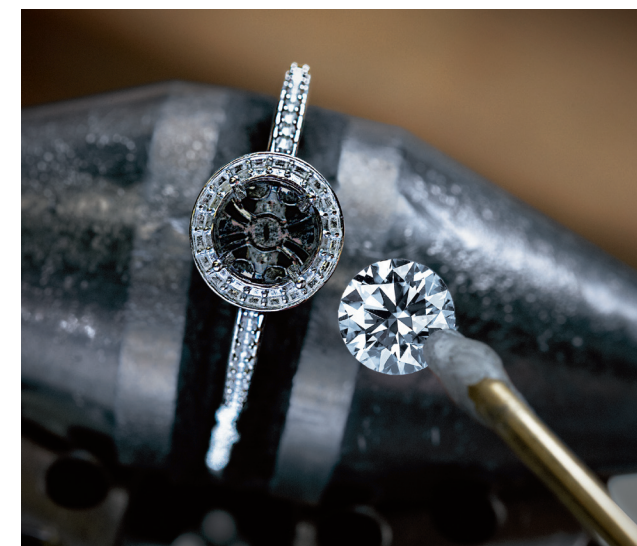
J. 122870 Oval-Shape Halo-Style Semi-Set Engagement Ring, 1 CT center (8x6mm), 3/8 CTW, 14K White, 32, size 7, $1,905 . Mounting 122870, $489 . 122871 Matching Diamond Band, 1/4 CTW, 14K White, 32, size 7, $1,185 . Mounting 122871, $339 . K. 122909 Cushion-Shape Halo-Style Semi-Set Engagement Ring, 1 1/4 CT center (6x6mm), 3/8 CTW, 14K White/14K Yellow, 32, size 7, $2,079 . Mounting 122909, $609 . 122959 Matching Diamond Band, 1/2 CTW, 14K White, 32, size 7, $999 . Mounting 122959, $409 .