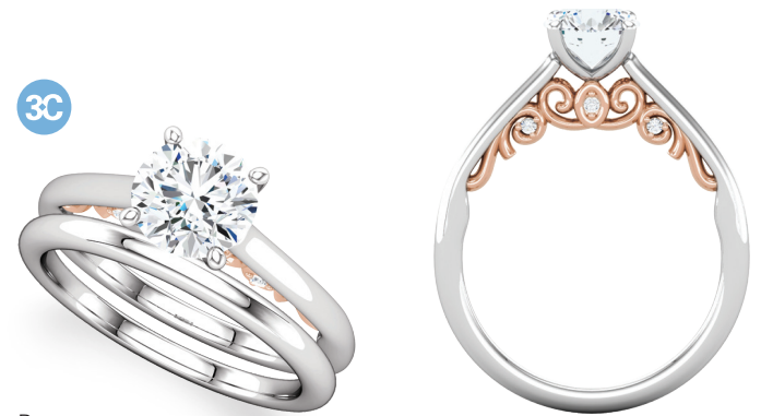
B. Available center stone shapes: