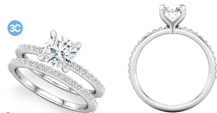
F. Available center stone shapes: