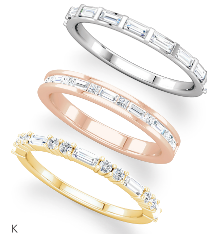
J. 123255 Diamond Anniversary Band, 0.08 CTW, 14K Rose, 32, size 7, $869 . Mounting 123255, $535 .