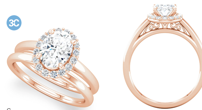
G. Available center stone shapes: