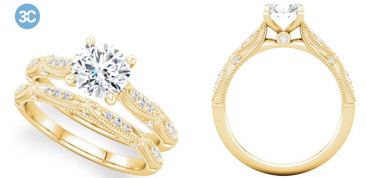
G. 123217 Round-Shape Solitaire Engagement Ring Mounting, 1 CT center (6.5mm), 14K White, size 7, $575 . 123217 Matching Band, 14K White, size 7, $409 . H. 123235 Round-Shape Diamond-Accented Semi-Set Engagement Ring, 1 CT center (6.5mm), 1/6 CTW, 14K Yellow, 32, size 7, $1,199 . Mounting 123235, $755 . 123235 Matching Diamond Band, 0.07 CTW, 14K Yellow, 32, size 7, $679 . Mounting 123235, $475 . J. 123197 Round-Shape Halo-Style Semi-Set Engagement Ring, 1 CT center (6.5mm), 1/6 CTW, 14K White, 32, size 7, $1,145 . Mounting 123197, $709 . 123197 Matching Diamond Band, 1/8 CTW, 14K White, 32, size 7, $739 . Mounting 123197, $525 .