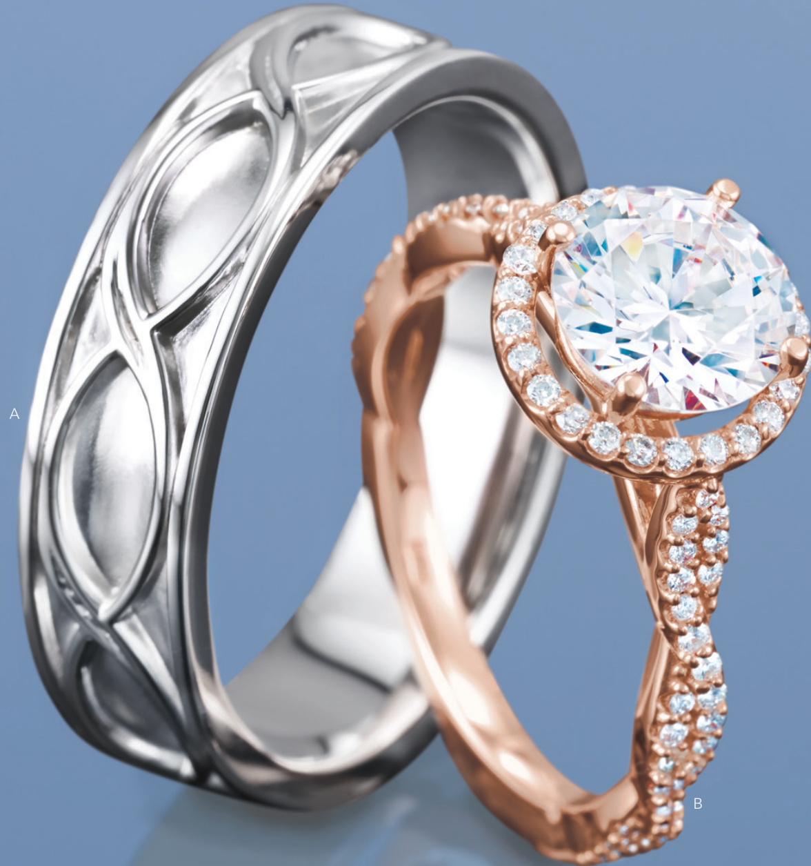
A. 51741 Infinity Wedding Band, 14K White, size 7, $959; size 11, $1,115

From subtle to breathtaking, our newest designs explore the delightful art of details — diamond accents that surprise, flowing lines of light, French-set radiance, and intricately sculptured elements.