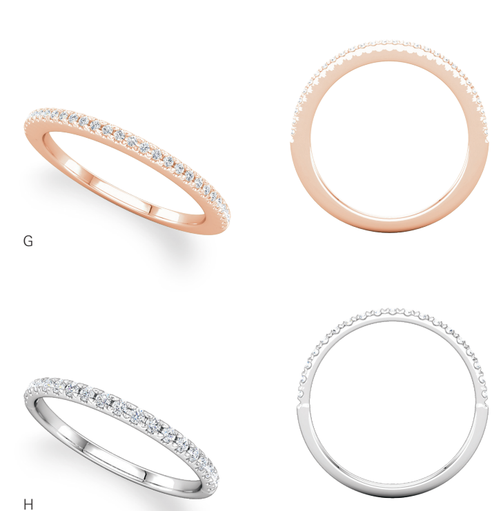
G. 123123 French-Set Diamond Anniversary Band, 1/6 CTW, 14K Rose, 32, size 7, $939 . Mounting 123123, $375 . H. 123227 Matching French-Set Diamond Band, 1/5 CTW, 14K White, 32, size 7, $825 . Mounting 123227, $285 .