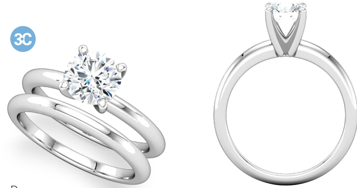
D. Available center stone shapes: