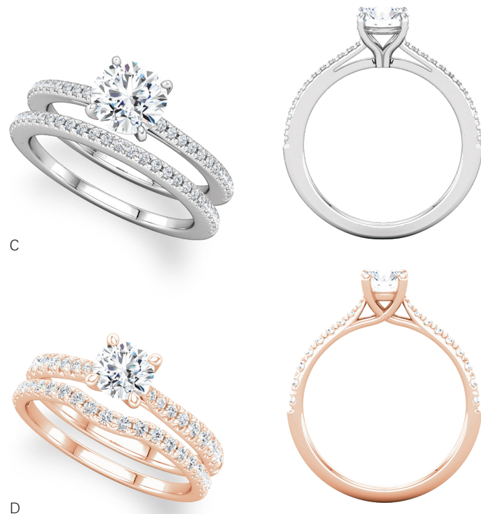
C. 123122 Round-Shape Diamond-Accented French-Set Semi-Set Engagement Ring, 1 CT center (6.5mm), 1/8 CTW, 14K White, 32, size 7, $905 . Mounting 123122, $465 . 123123 Matching French-Set Diamond Band, 1/8 CTW, 14K White, 32, size 7, $935 . Mounting 123123, $395 . D. 123230 Round-Shape Diamond-Accented French-Set Semi-Set Engagement Ring, 1 CT center (6.5mm) 1/4 CTW, 14K Rose, 32, size 7, $1,135 . Mounting 123230, $475 . 123230 Matching French-Set Diamond Band, 1/5 CTW, 14K Rose, 32, size 7, $875 . Mounting 123230, $319 .