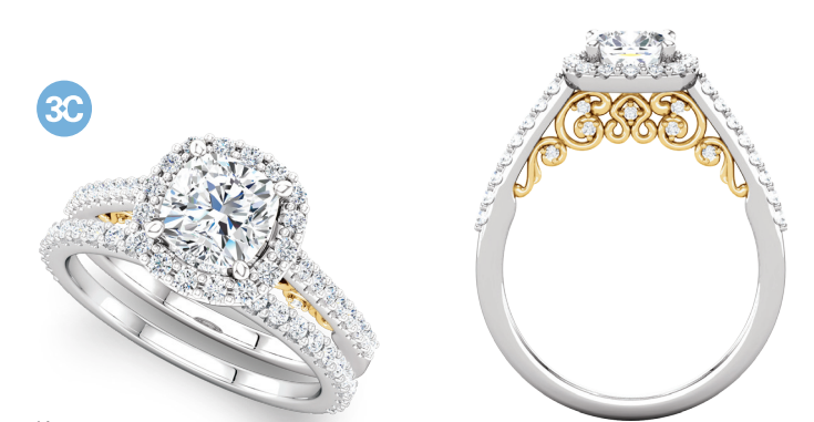
K. Available center stone shapes: