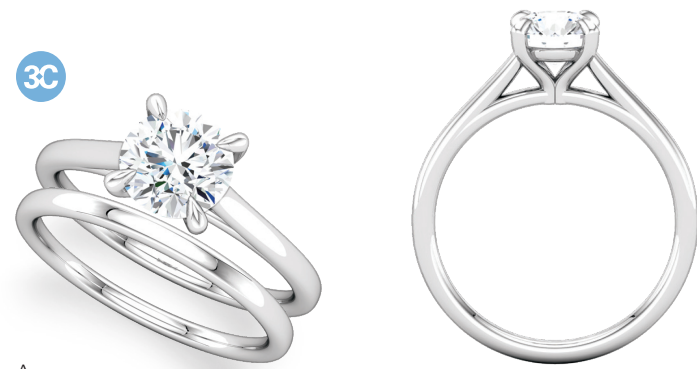
A. Available center stone shapes: