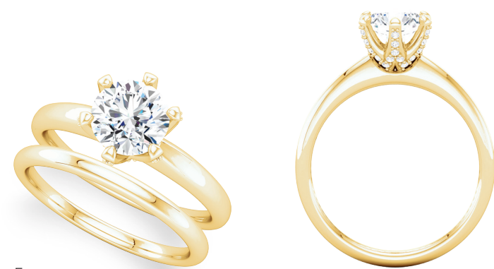
E. Available center stone shapes: