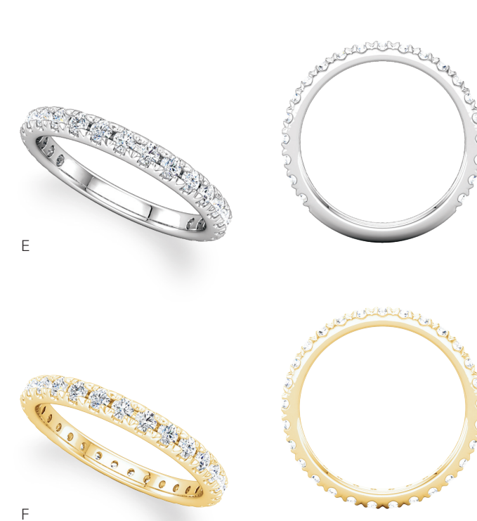
E. 123223 French-Set Diamond Anniversary Band, 5/8 CTW, 14K White, 32, size 7, $1,739 . Mounting 123223, $425 . F. 123225 French-Set Diamond Eternity Band, 7/8 CTW, 14K Yellow, 32, size 7, $2,209 . Mounting 123225, $309 .