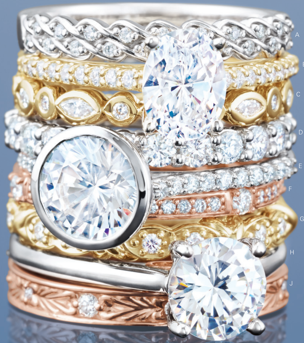
A. 123302 Diamond Anniversary Band, \frac{1}{10} CTW, 14K White, 32, size 7, $819 . Mounting 123302, $559 .