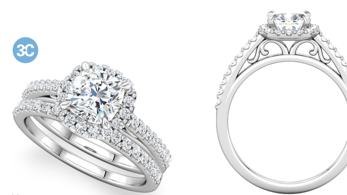
H. Available center stone shapes: