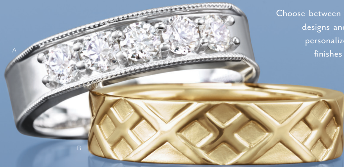
A. 123291 Round-Shape Men's Diamond Wedding Band, 1 1/2 CTW (5- 3.8mm), 14K White, 32, size 11, $6,369 . Mounting 123291, $1,679 . B. 51716 Patterned Wedding Band, 6.4mm top width, 14K Yellow, size 7, $1,075 ; size 11, $1,279

Choose between new masculine designs and classic bands personalized with special finishes and engraving.