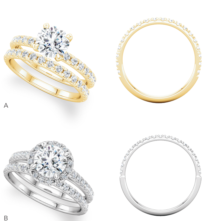
A. 123229 Round-Shape Diamond-Accented French-Set Semi-Set Engagement Ring, 1 CT center (6.5mm), 1/3 CTW, 14K Yellow, 32, size 7, $1,505 . Mounting 123229, $379 . 123229 Matching French-Set Diamond Band, 3/8 CTW, 14K Yellow, 32, size 7, $1,579 . Mounting 123229, $335 . B. 123227 Round-Shape Halo-Style French-Set Semi-Set Engagement Ring, 1 CT center (6.5mm), 1/5 CTW, 14K White, 32, size 7, $1,065 . Mounting 123227, $379 . 123227 Matching French-Set Diamond Band, 1/4 CTW, 14K White, 32, size 7, $825 . Mounting 123227, $285 .